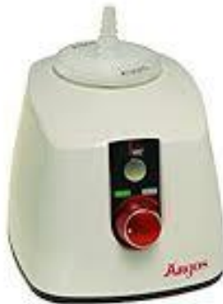
Digital Tube Roller, 6 Roller Version